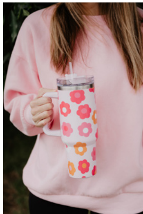
Katydid is offering 12 styles of 40-ounce insulated tumblers which include a straw. Available in both patterns and solids the mugs wholesale for $18. ( www.katydidwholesale.com )