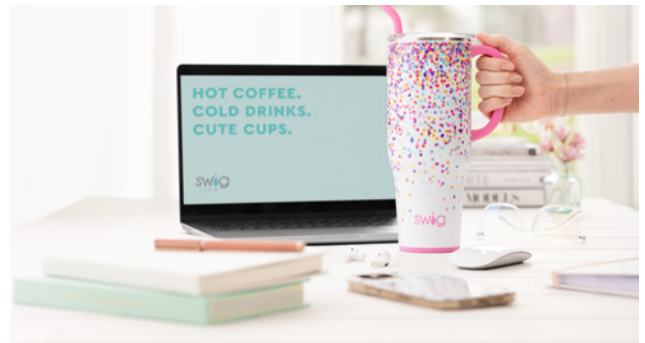
Mega mugs from Swig boast a silicone straw, easy-to-grip handle and are reported to keep drinks cold for 24 hours. $22 cost. ( www.swigwholesale.com )