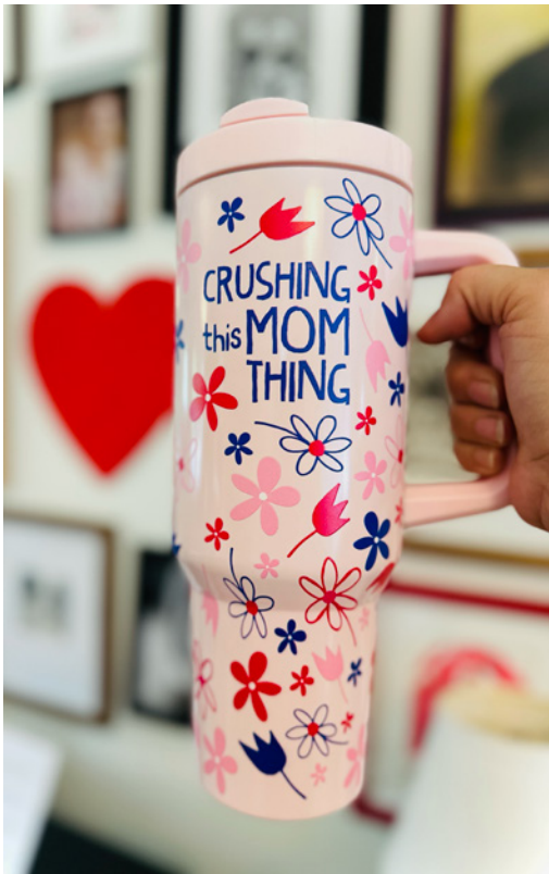
Crushing this Mom Thing is one of the bestselling 40-ounce insulated tumbler styles from Funatic . Available in 16 styles for $14.75 cost. ( www.funatic.com/wholesale )

With three buildings averaging 18 floors in each, the Atlanta Market produced bi-annually in July and January by AndMore in the AmericasMart buildings in Atlanta is one of the industry's must-attend events, where a large gathering of vendors and buyers meet to see what's new and what's hot. As our editors and contributing writers walked the aisles this past July, a number of trends easily introduced themselves. Here we present a snapshot of the trends we spotted, but be sure to stay tuned to future issues for more trends along with hot new product releases we uncovered just for you.