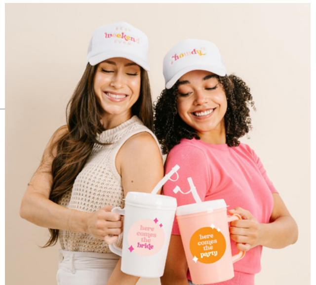
The Darling Effect is offering a 40-ounce mug in their darling prints but we also liked their 34-ounce plastic tumbler that comes with a handle and straw for $14 cost. Available in three styles – Here Comes the Bride, Here Comes the Party and Dink and Drink for the pickleball fans out there. ( www.thedarlingeffect.com )